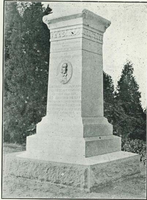
MONUMENT TO LAURA INGERSOLL SECORD QUEENSTON HEIGHTS