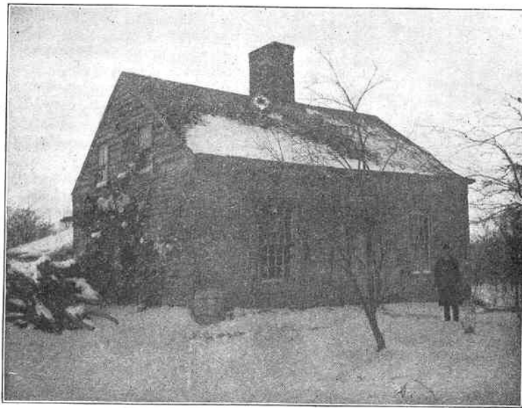
This house, near the Western Home, is supposed by some to have been built before the war of 1812. It is a log building afterwards clapboarded, and contains five fire-places. For many years, previous to 1827 and subsequently, the private school of Miss Young was taught here.

A view taken of the kitchen fire-place with old fashioned crane will appear in next issue.